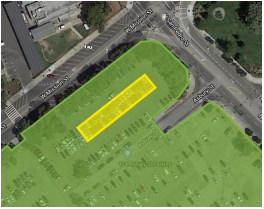
Figure 1. Employee Parking for All Types of Vehicles (green) Electric Vehicle Charging Stations (yellow)

The City of San Jose installed 42 Electric Vehicle Charging Stations in the secured employee parking lot located at the southwest corner of W. Mission Street and N. San Pedro Street (Fig. 1).